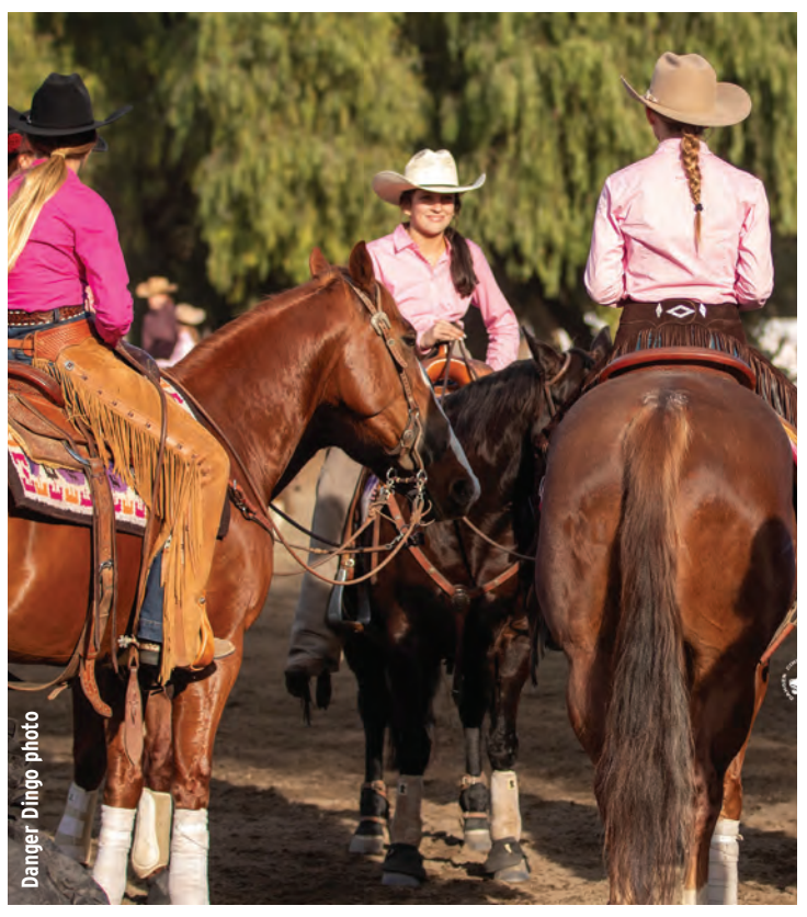
SCRCHA has an up-and-coming group of girls showing in the Youth Divisions.