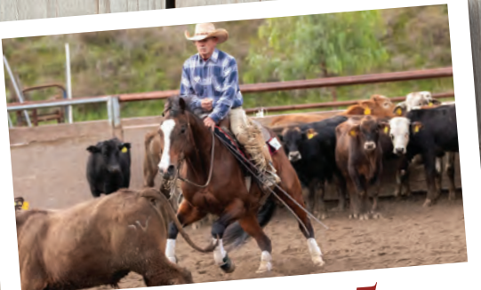
January 3-5 Kick Off Show Tucalota Creek Ranch