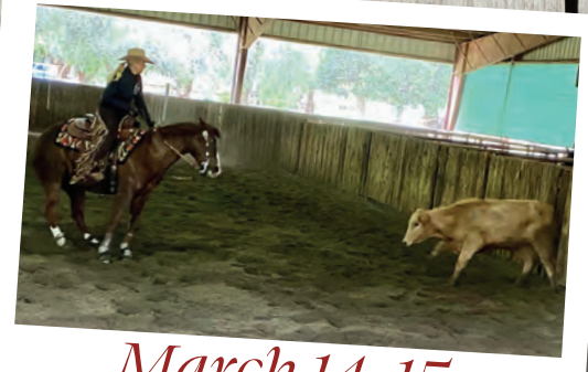
March 14-15 March Schooling Show Tucalota Creek Ranch