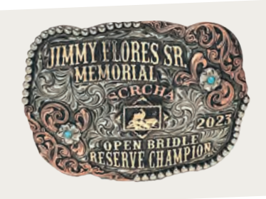
May 9-11 Jimmy Flores Memorial Green Acres Ranch