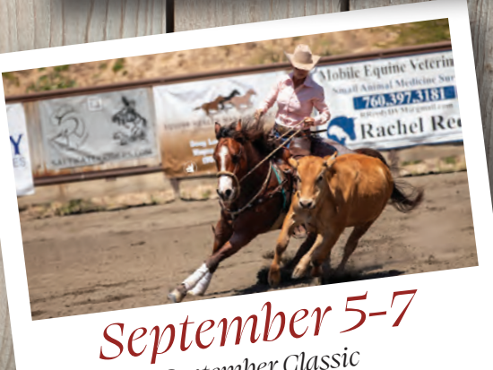
September Classic Green Acres Ranch