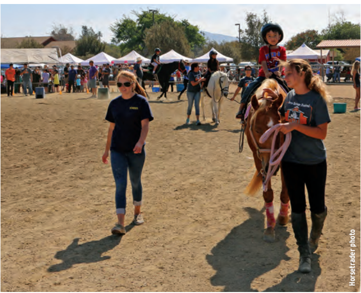
City-sponsored "cross-over" events that bring together a town's horsepeople and nonhorsepeople, like the Heritage Horse Festival in San Marcos, raise awareness of horses and their positive impact in a community. This year's 15th annual Ride & Stride Fund-raiser at Walnut Grove Park will be on Sunday, Oct. 17.